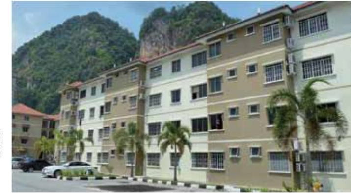
The Permai does not resemble a low-cost project.

The Haven, the company's current flagship project, is not only an eco-condominium with green