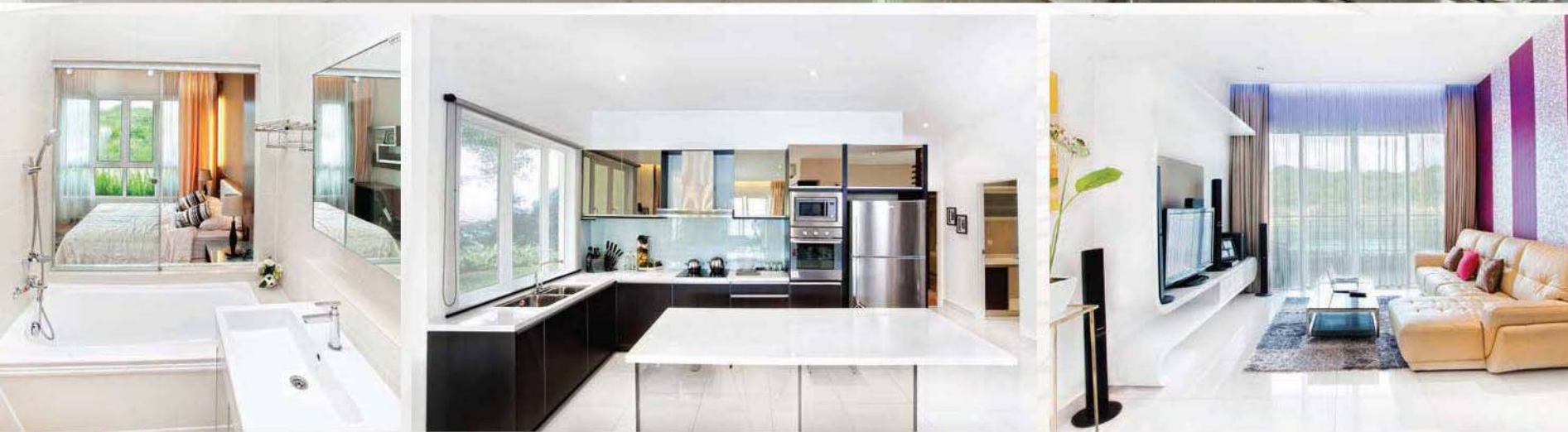
Actual photographs from The Haven show house