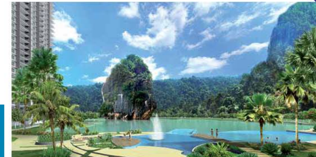
The Rockhaven (centre) is nature's "masterpiece" in The Haven.

features. It is going to be run by Best Western International (BWI) as a five-star hotel for short-stay and long-term guests. Many of the units that have opted for the lease-back scheme, will be luxuriously furnished (see winning features next page).