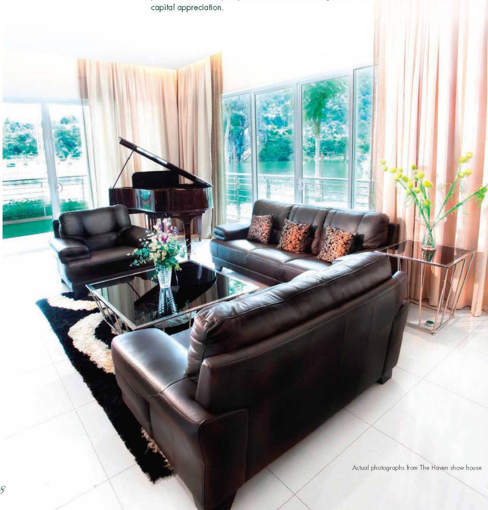
Actual photographs from The Haven show house

Having a brand name like Best Western Premier to manage The Haven's residences not only assures that their decades of experience carries through to provide unrivalled quality but the worldwide recognition of brand ensures sustainable capital appreciation.