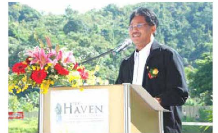
YAB DATO'S SERI DR. ZAMBRY BIN ABD KADIR Menteri Besar of Perak

"I am glad Ipohreans are not losing out as more than 50% of buyers at The Haven are locals. This represents a changing mindset of Ipoh residents towards high-rise property ownership in this city."