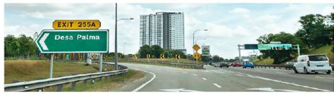
EXIT 255A to Desa Palma

The Centra Residences is adjacent to the North-South Highway, and is surrounded by an efficient traffic network accessible to all major highways, Johor Bahru city centre and CIQ-Singapore via EDL Highway.