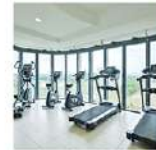
Gymnasium with a view

URBAN LIVING REACHES NEW HEIGHTS OF GLAMOUR AT CENTRA RESIDENCES