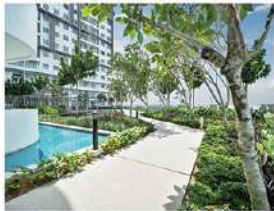
Water features with lush GreenScope