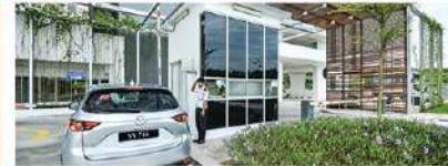
Guardhouse at Entrance