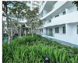
View surrounding landscapes