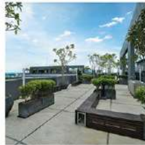
Rooftop Garden with BBQ