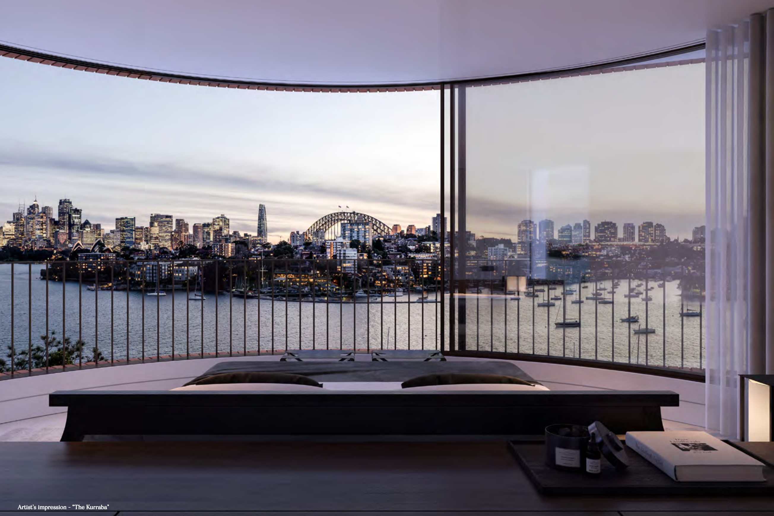
Artist's impression - "The Kurraba"