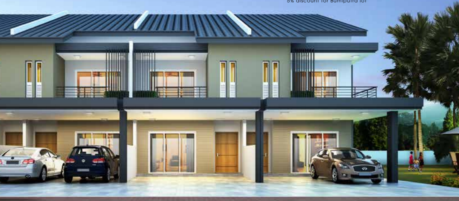
artist impression only