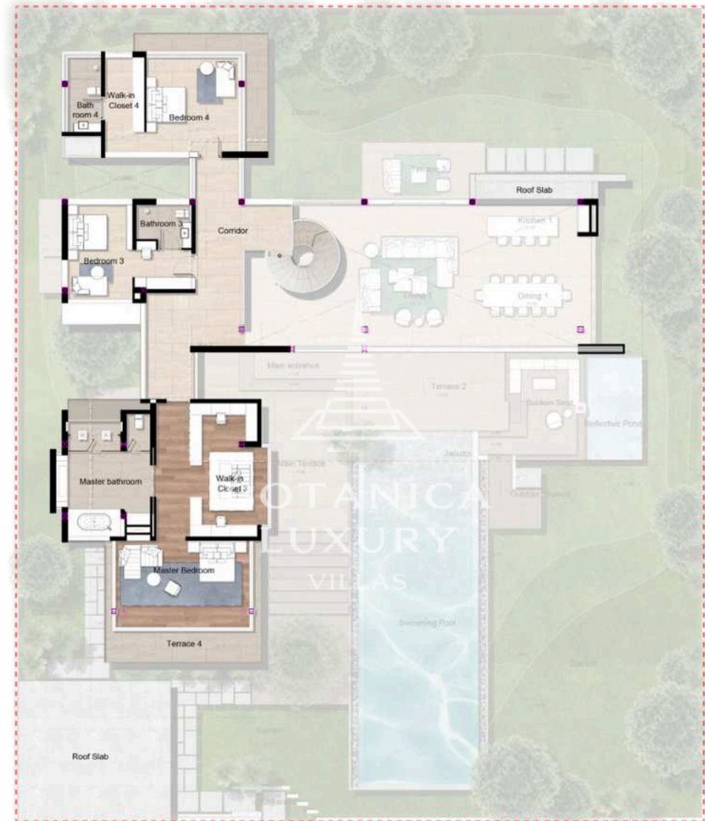
Upper Level Plan

Internal Area : 605 sq.m. External Area : 495 sq.m. : All Area : 1,100 sq.m.