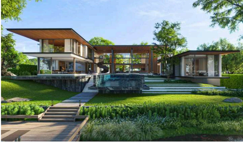
Grand Modern Luxury