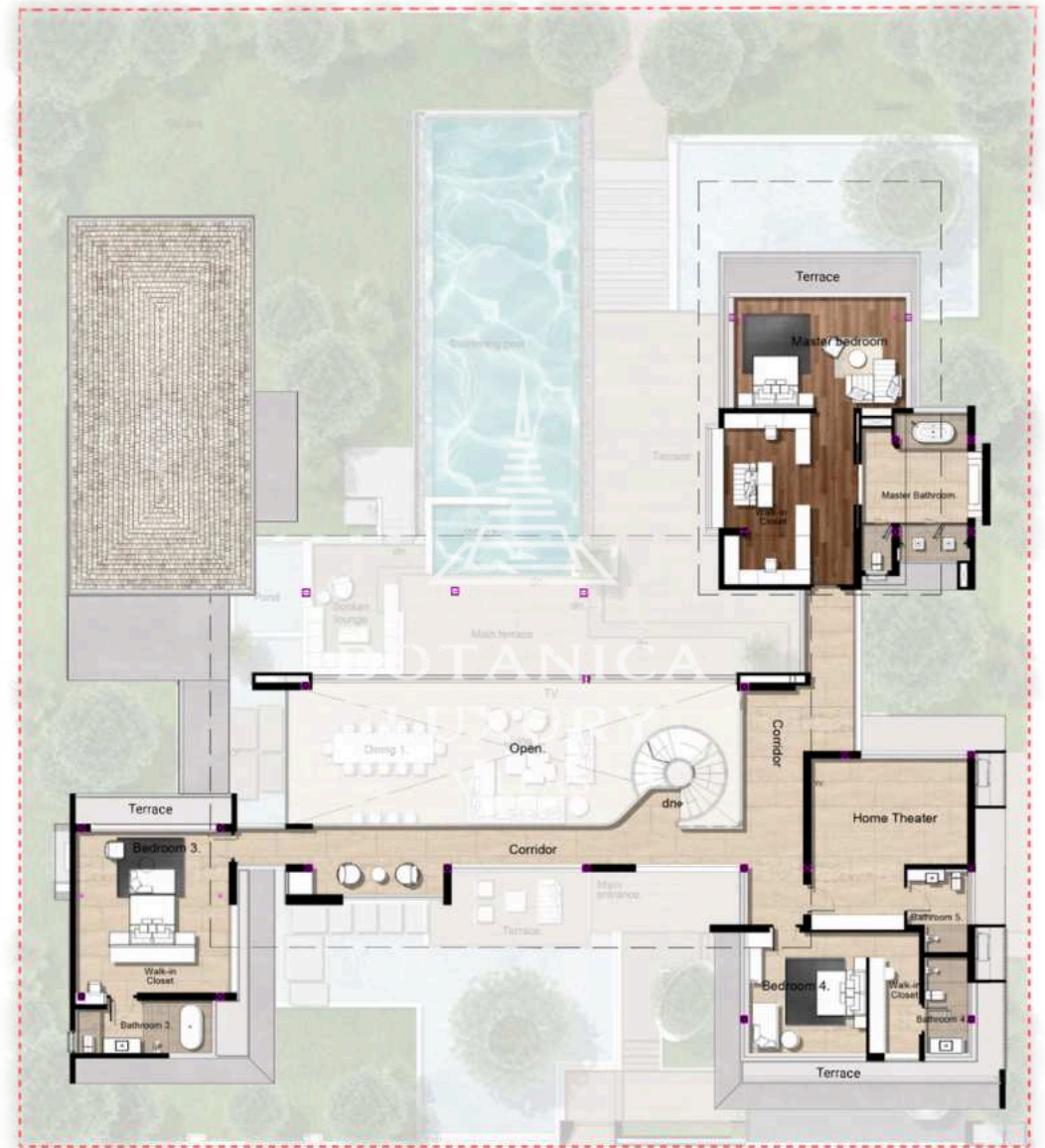
Upper Level Plan

Internal Area : 817 sq.m. External Area : 883 sq.m. : All Area : 1,700 sq.m.