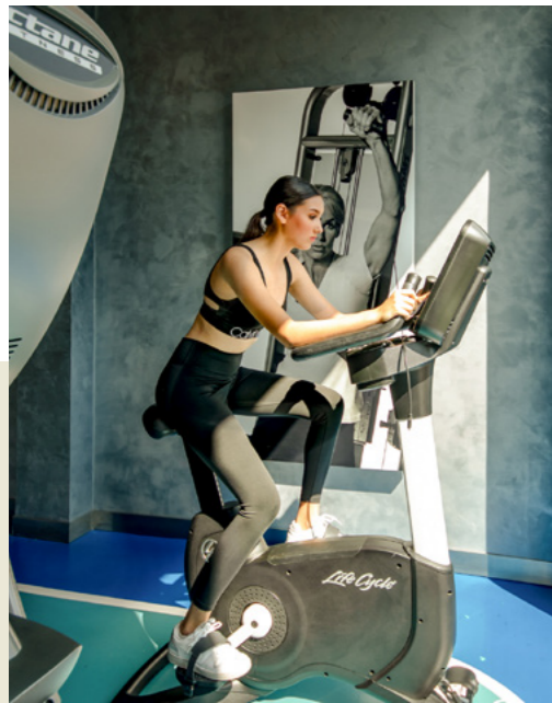
Gym & Fitness center

With Amenities including The best-in-class RPM gym, Tennis Courts, Underground parking with elevator access to your building, 24 hour security, as well as restaurants and bars and of course, Asia's premier marina to look over from your balcony.