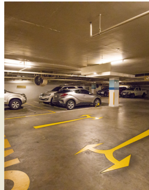
Underground car parking