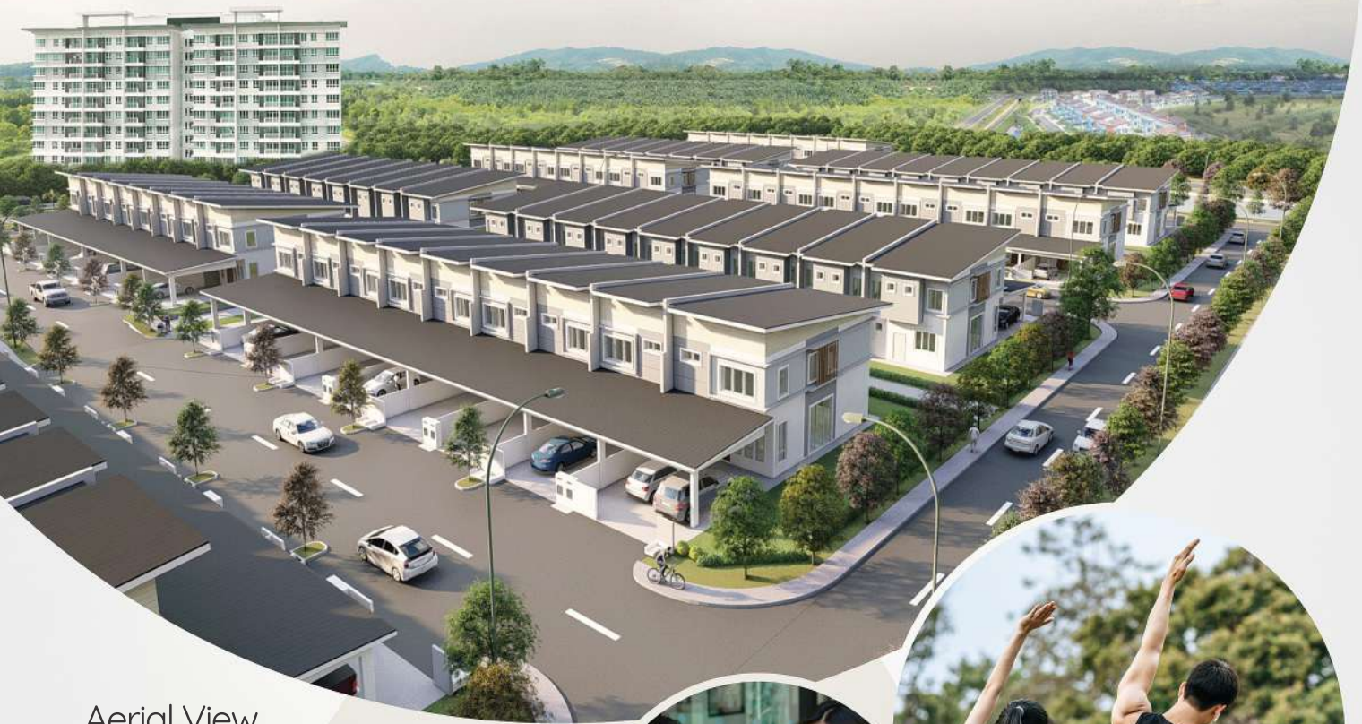
Aerial View Utama South Park

An award winning well planned & integrated township with work-life balance