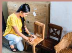
IKEA Tebrau TOPPEN Shopping Centre