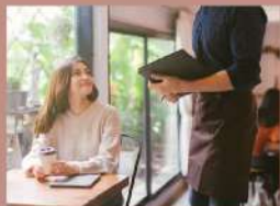
TD Point, TD Central & TD Sports Centre