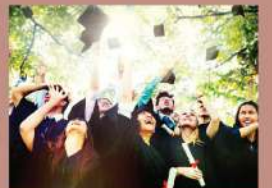
Sunway College Johor Bahru Crescendo International College