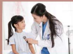
Sultan Ismail Hospital KPJ Bandar Dato Onn Specialist Hospital