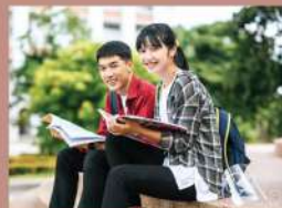
Austin Heights Private & International Schools Fairview International School