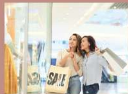
AEON Mall Tebrau City Lot's Desa Tebrau