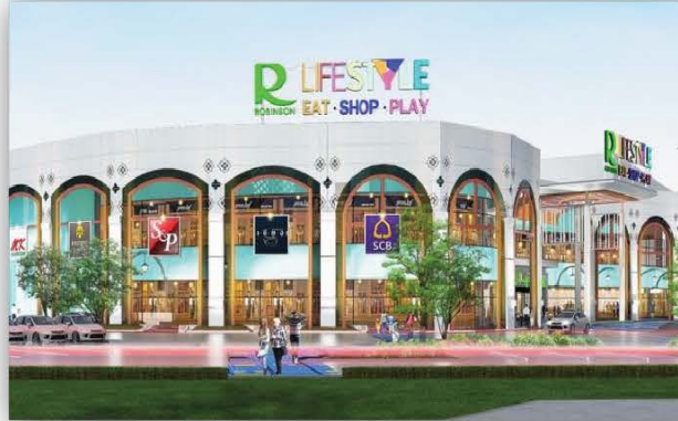
ROBINSON DEPARTMENT STORE-THALANG