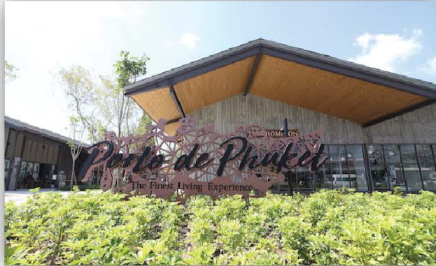
PORTO DE PHUKET