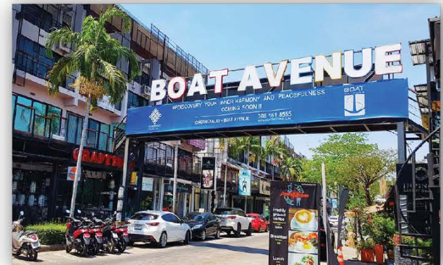
BOAT AVENUE MODERN STREET MALL