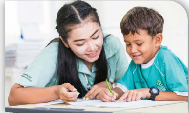
KAJONKIET INTERNATIONAL SCHOOL