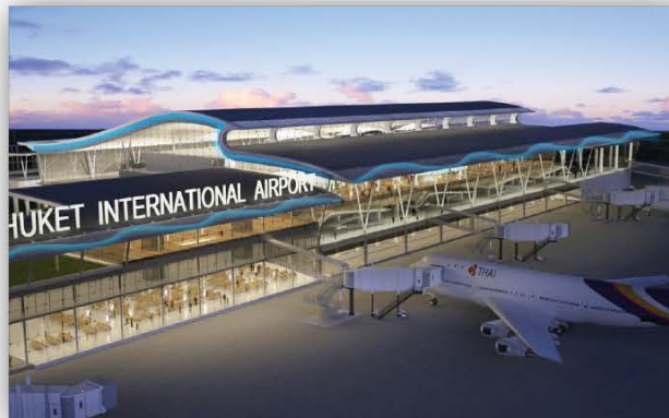
PHUKET INTERNATIONAL AIRPORT