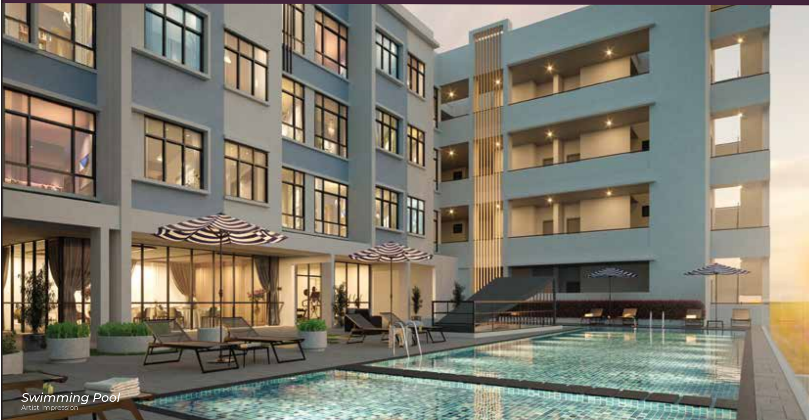
Swimming Pool Artist Impression