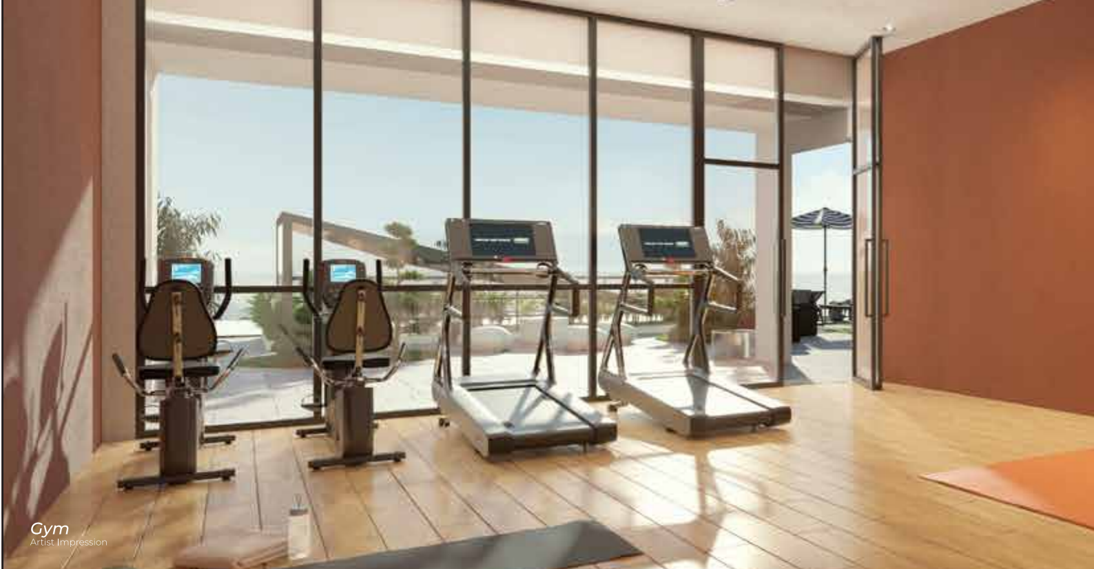
Gym Artist Impression