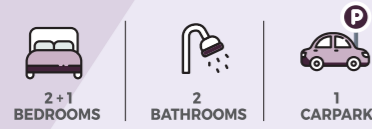
TYPE A 790 SQ.FT.