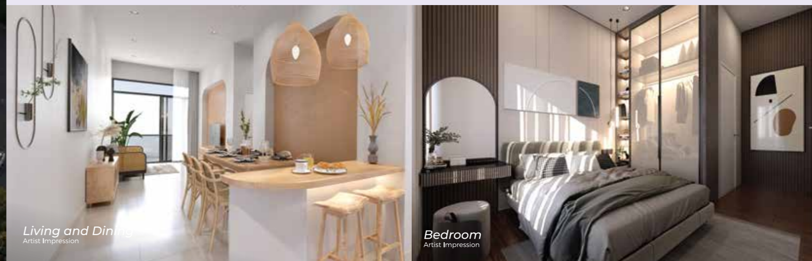
Living and Dining Artist Impression