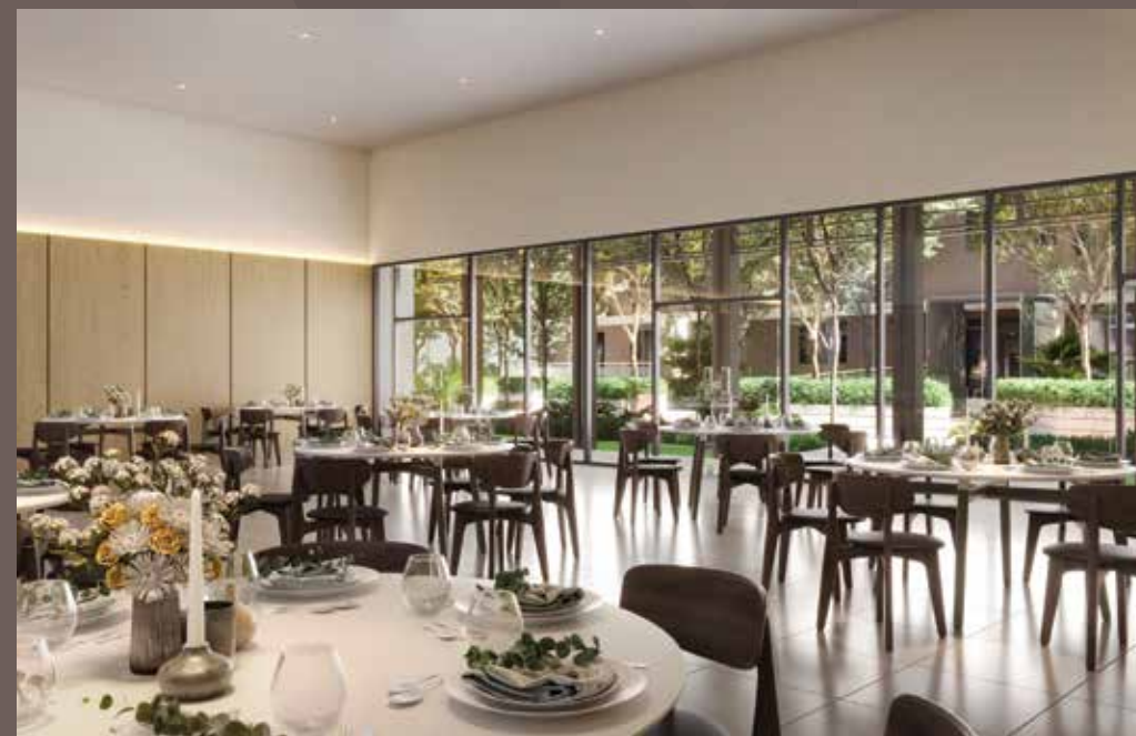
Chic and stylish convenience: space for you to play host 时尚优雅又便利：善尽主人之谊