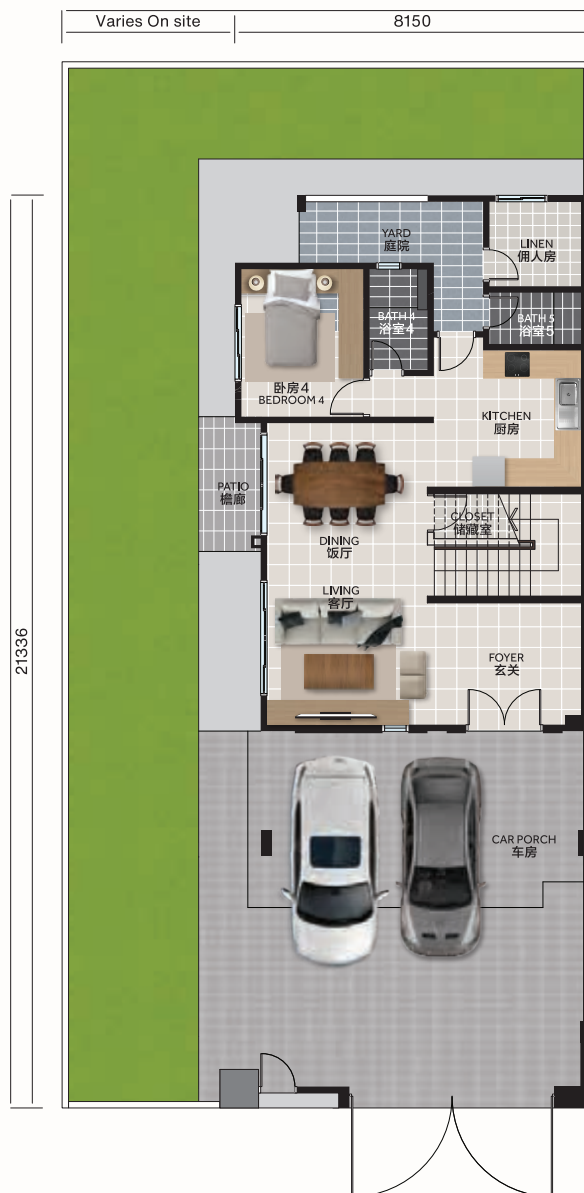
Ground Floor 底楼