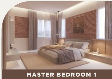
MASTER BEDROOM 1