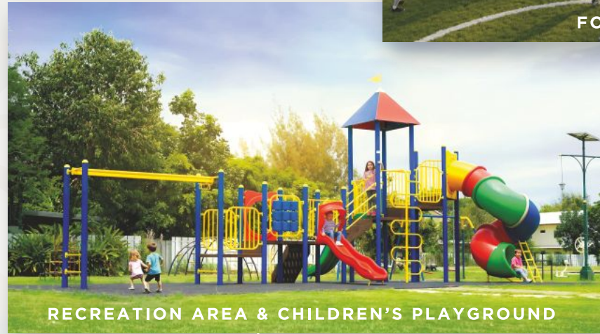
RECREATION AREA & CHILDREN'S PLAYGROUND