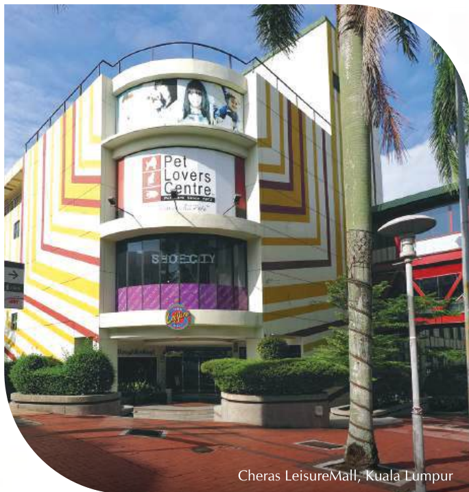
Cheras LeisureMall, Kuala Lumpur