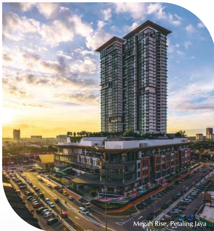
Megah Rise, Petaling Jaya

PPB Properties' projects include Megah Rise in Petaling Jaya, Southern Marina Residences in Iskandar Puteri, Taman Tanah Aman in Penang and Taman Sinar Mentari in Kedah. The business also owns and manages several retail projects, including Cheras LeisureMall in Kuala Lumpur, New World Park, and The Whiteaways Arcade in Penang.