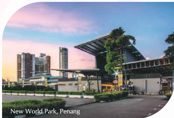
New World Park, Penang