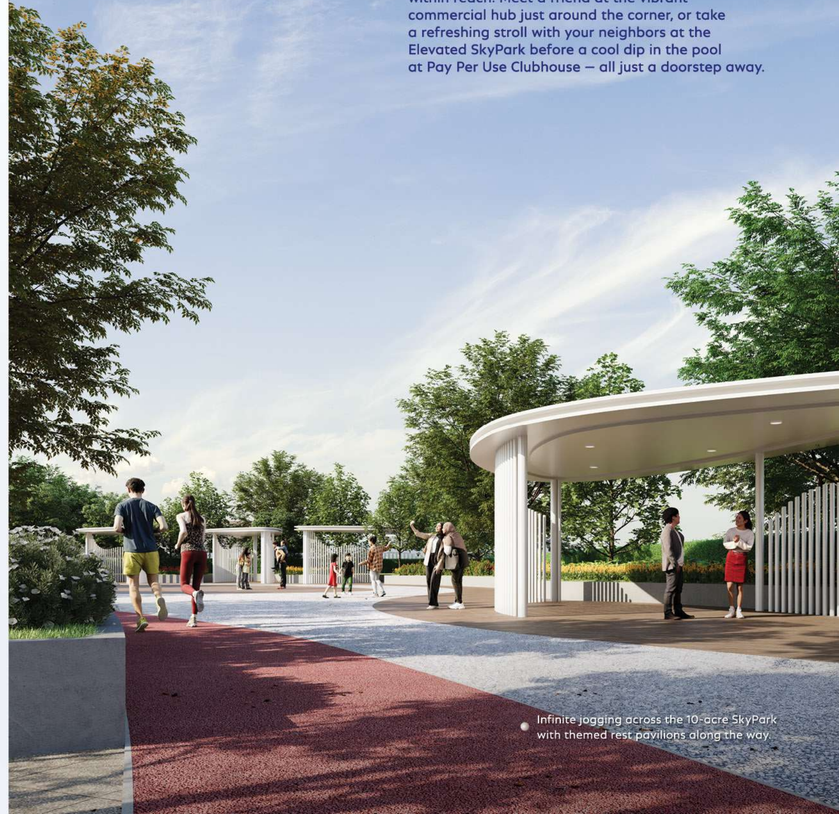
Infinite jogging across the 10-acre SkyPark with themed rest pavilions along the way.

Imagine a life where every routine is effortlessly within reach. Meet a friend at the vibrant commercial hub just around the corner, or take a refreshing stroll with your neighbors at the Elevated SkyPark before a cool dip in the pool at Pay Per Use Clubhouse – all just a doorstep away.