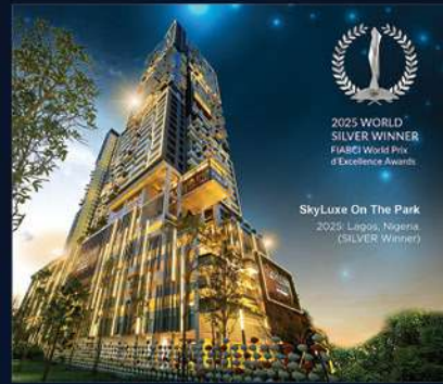
SKYLUXE ON THE PARK