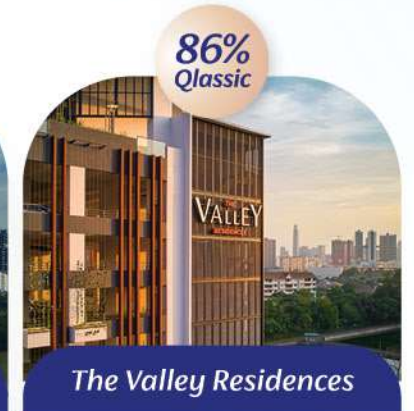
The Valley Residences