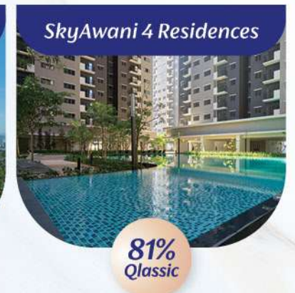
SkyAwani 4 Residences