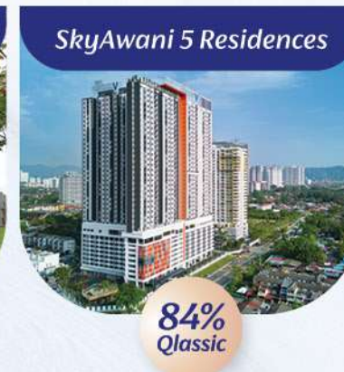
SkyAwani 5 Residences