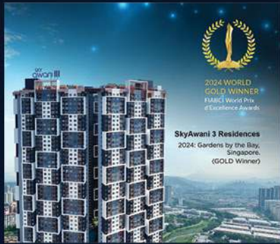
SKYAWANI 3 RESIDENCES