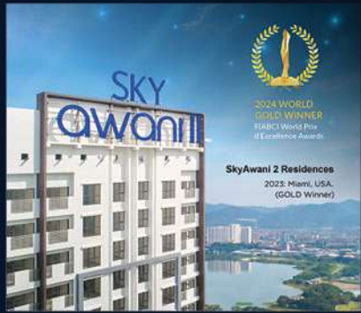
SKYAWANI 2 RESIDENCES